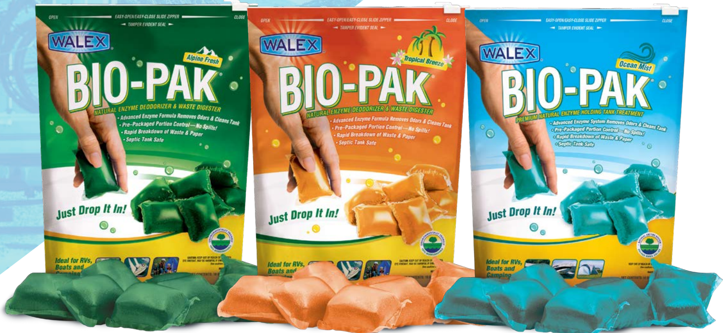
BIOPPBG BIOPPBGCA (bilingual)